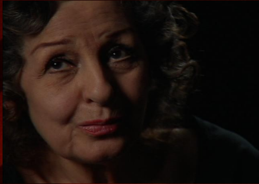
Jewish pediatrician describing her love for the children she tried to save in FINAL GIFTS.

ranging from student movements, police brutality, to homelessness action. Discussion of points of solidarity between our communities facilitated by the film topics. Q + A afterwards on basic skills for making your own remix videos.