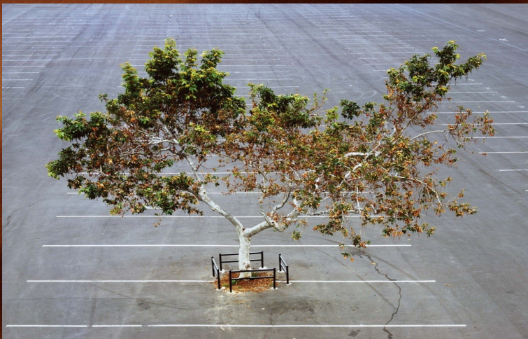
A lonely and forlorn sycamore tree is stuck in the middle of a giant parking lot at the Rose Bowl in Pasadena, California in Sick-Amour.