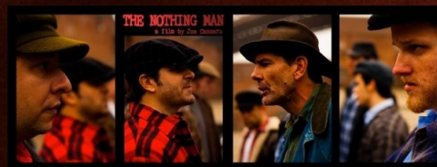
Poster of The Nothing Man

Free Admission and Free Snacks. Because everything should be free!