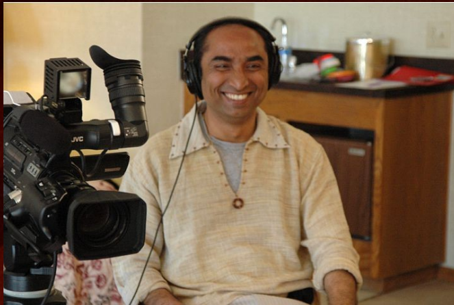
Director in Action. From Kundalini.

Free Admission and Free Snacks. Because everything should be free!