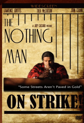
Poster of The Nothing Man