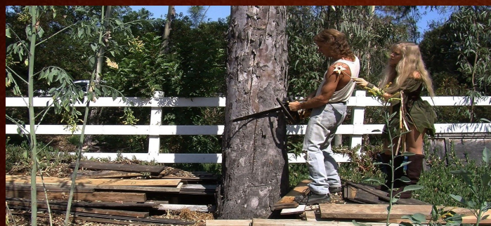
Scene from Plight of the Earth Fairy . Photo by Kim Sheridan