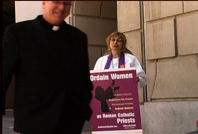
Protest at Bishops Conference in Pink Smoke Over The Vatican .

Free Admission and Free Snacks. Because everything should be free!